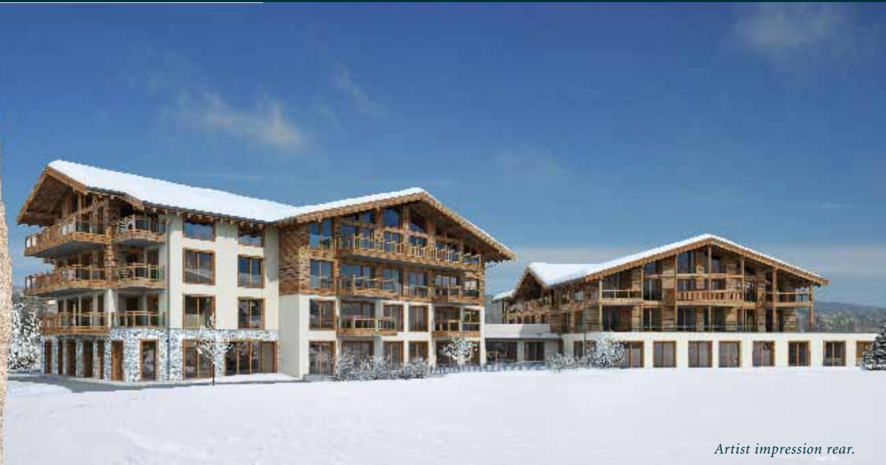
Artist impression rear.

Info: Romex Investments B.V., Röntgenlaan 1, 2719 DX Zoetermeer T +31 (0) 79 3615927 | www.romex-investments.com